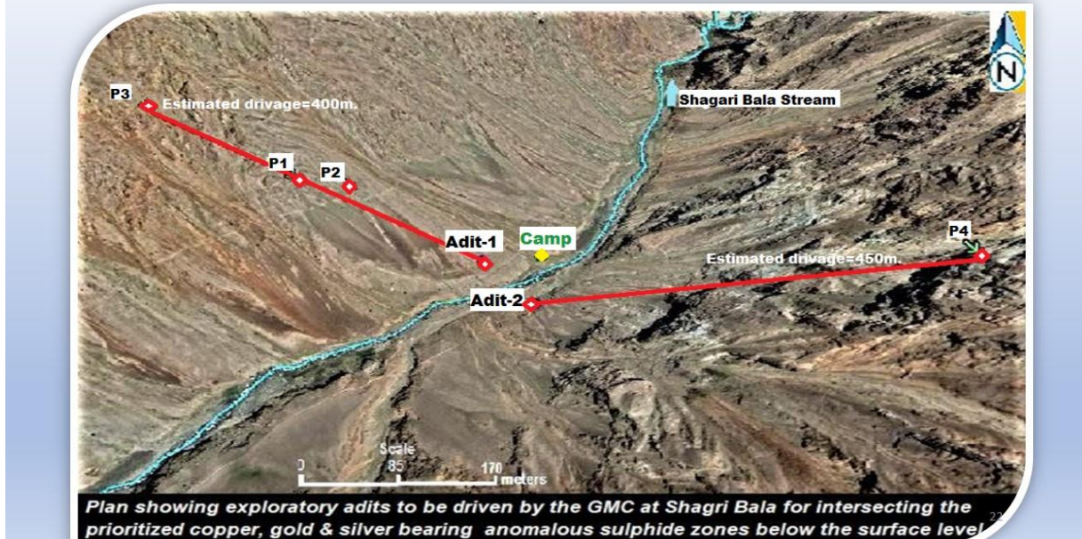
Fig - 1